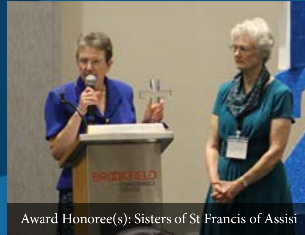
Award Honoree(s): Sisters of St. Francis of Assisi